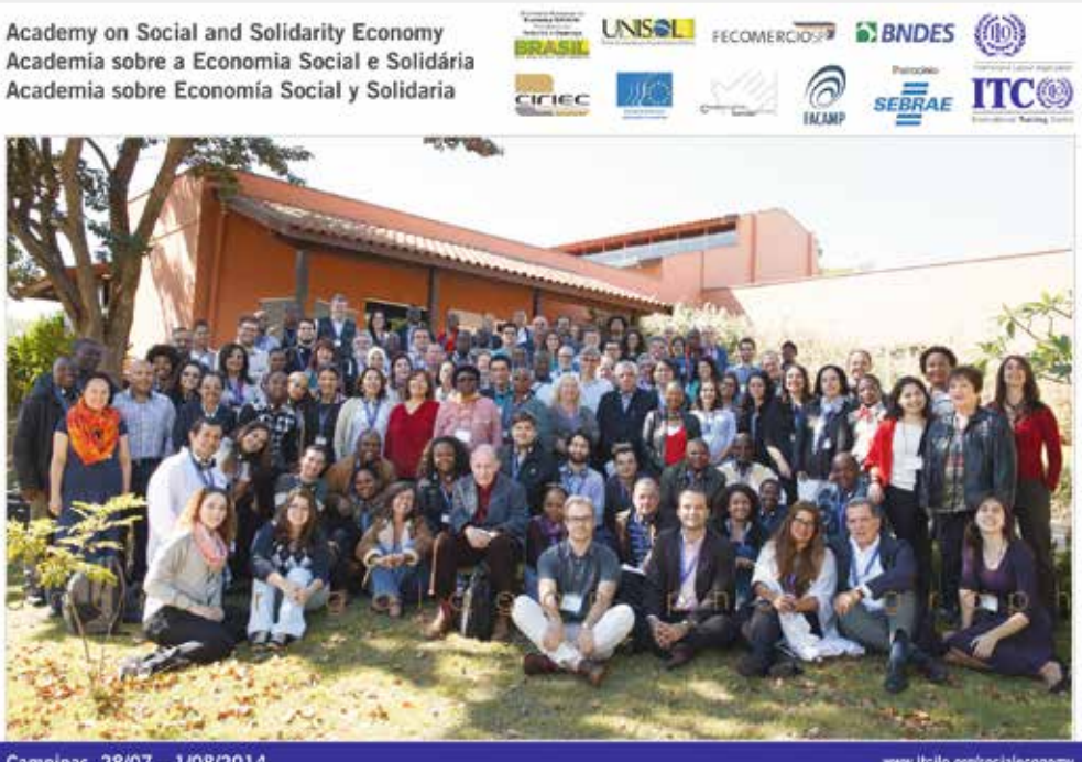
Campinas, 28/07 - 1/08/2014

The Academy had a special focus on the SSE Organizations' (SSEOs') added value in terms of inclusivity and sustainability and the role that the SSE can play in the post-2015 development agenda debate.